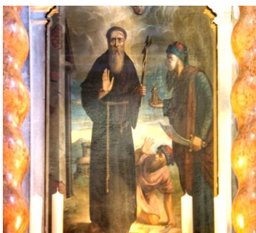
Altar of Saint Nikola Tavelić

church of St. Francis of Assisi, Šibenik, Croatia